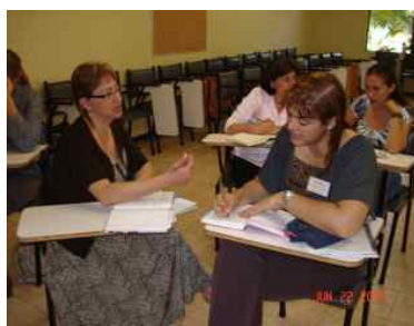
Participants discuss HR issues