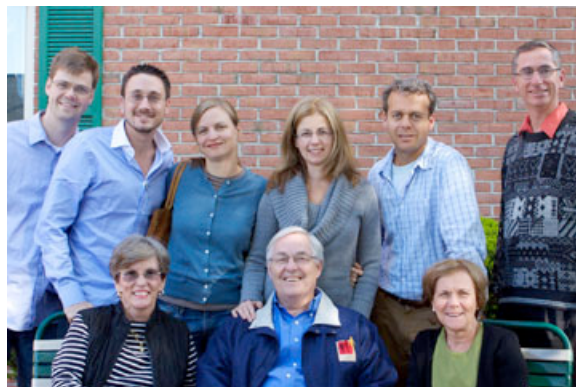
Strachan Foundation Board Members