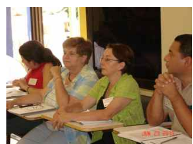
Participants at the HR Seminar